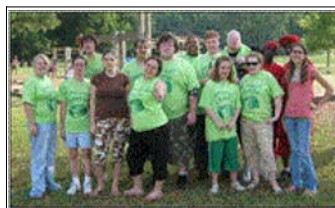
Students in the DSB Jump Start program take time for a picnic at Murray Park in Little Rock, Arkansas.

The Arkansas Department of Human Services Division of Services for the Blind (DSB) recently held its annual Jump Start program, a transition course for high school students who are blind or severely visually impaired. Students came from across Arkansas for a three-week summer program.